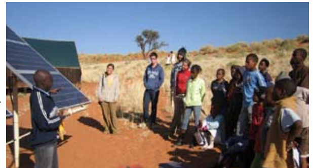
Learning how solar panels work

about the biodiversity of the desert, alternative sources of energy, how to cook with a solar oven and a solar cooker, and how to conserve water and other resources. They also had a fun time playing various educational games as well as playing on the dunes. It was a wonderfully educational and fun experience! I have attached several pictures showing some of our activities at the center.