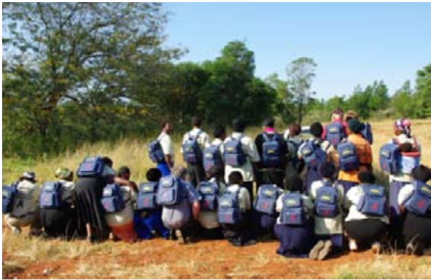
Field workers with their medical packs

The Swaziland Reformed Church website offers more information about the HIV/AIDS work that the organization is carrying out. Here is a brief description of the Home-Based Caring project, which MPCA supported through funds for purchasing medical supplies and backpacks: