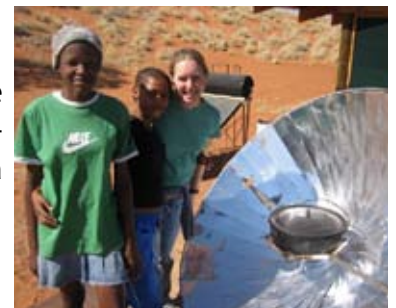
Cooking with solar energy