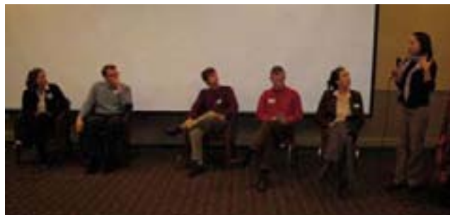
Panel Discussion, Parent Brunch